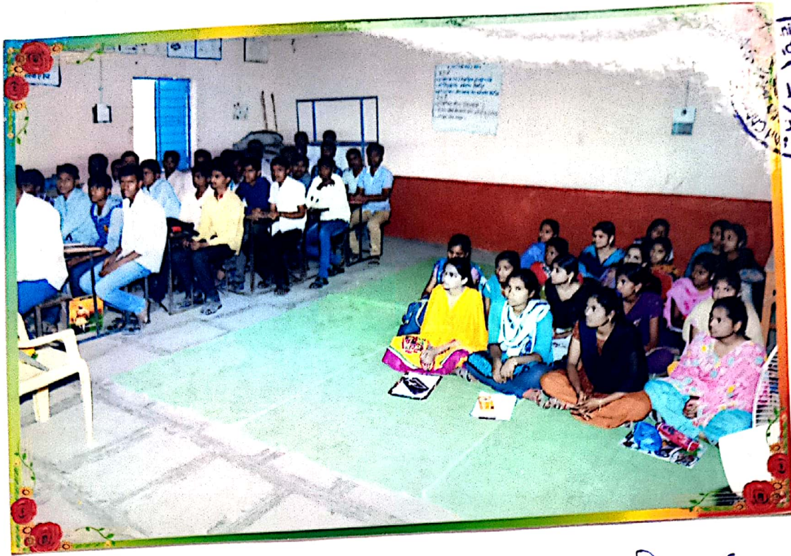
कला महाविद्यालय, आडल, AIDS जनजागृती कार्यक्रम 2019-20